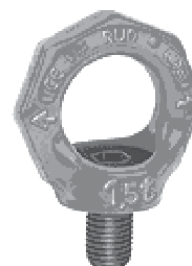
Another generation of eyebolt

This safety instruction/declaration of the manufacturer has to be kept on file for the whole lifetime of the product.